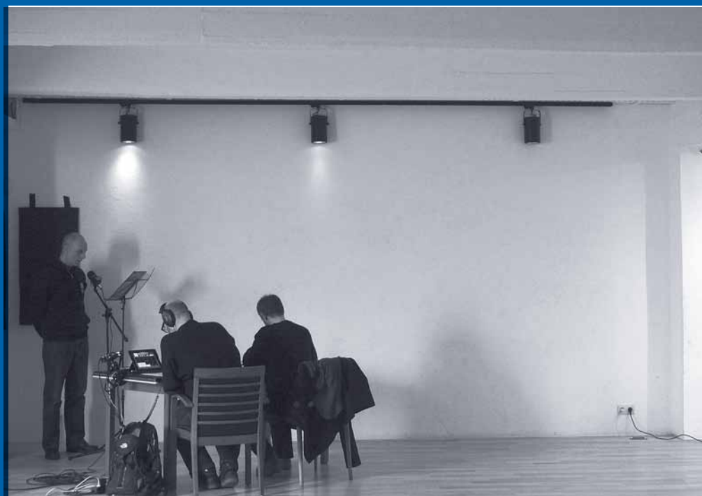
Top & right: Idiomatic / Dub it: One voice, many languages actors.