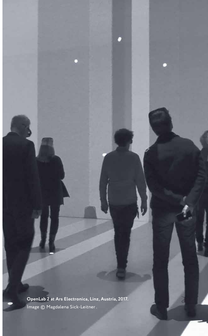
OpenLab 2 at Ars Electronica, Linz, Austria, 2017.

In the Stage Your City research project of the ETC’s European Theatre Lab, one could say that we put a multitude of technologies on our plate to test new tools for redundancy. Where do technologies demand change from the traditional artistic creation process? We should embrace the process and invite digital tools into it, not work against it. With these tools we can now invite the audience into the process and have technically supported interaction in the plays. I hope this takes away the concern about redundancy. The audience sees the digital as a medium for storytelling in social media already. So, yes: we CAN catch up with the audience!