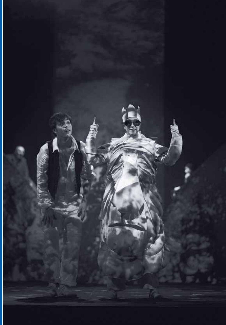
Left: Kraljevo / The King's Fair [Den siste kongsfesten] premiere, Det Norske Teatret, Norway, 2018.