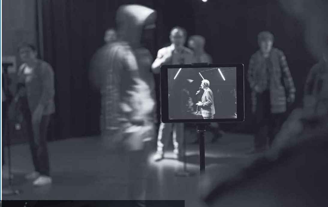
Top & right: Stage Your City premiere, CDN Nancy Lor- raine La Manufacture, France, 2018.