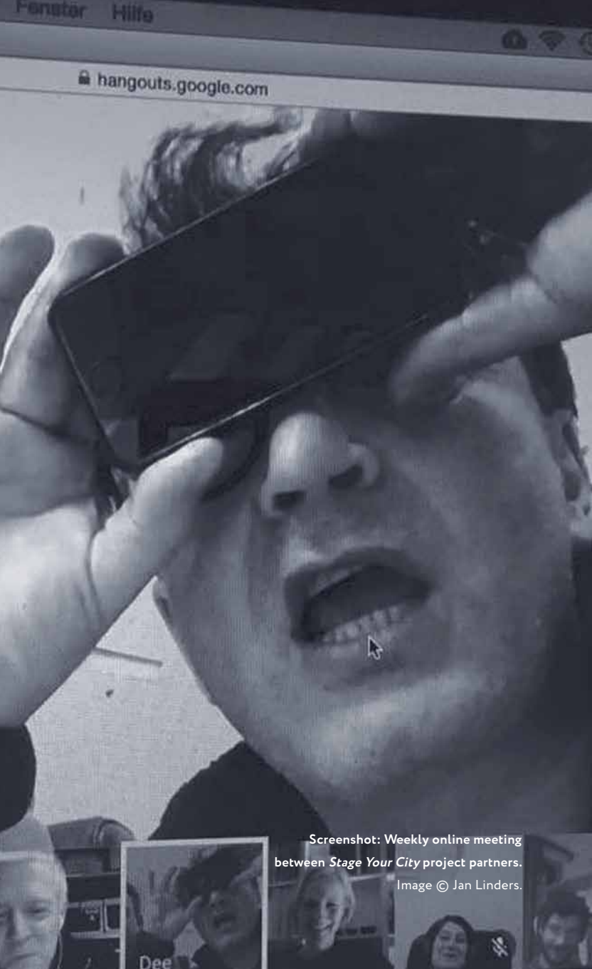
Screenshot: Weekly online meeting between Stage Your City project partners.

performer and the audience. And there are those who understand how to create a digital universe and user interfaces.